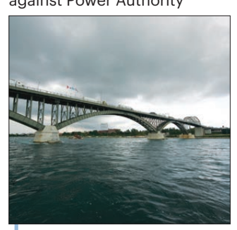
1989: Becomes first area law firm to open office in Canada

1964: Defends insurance companies in major lawsuits against Power Authority