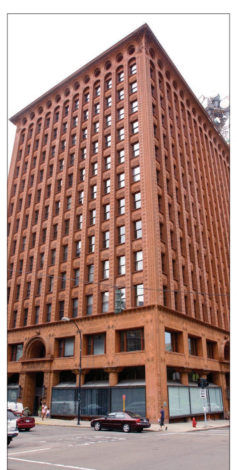
2002: Guaranty Building purchased for headquarters

2005: Acquires New York City firm, adding 21 attorneys