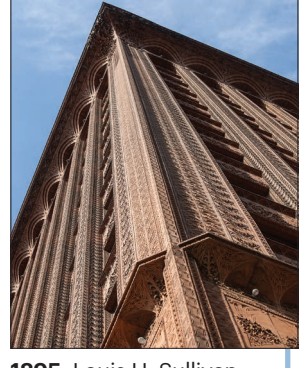
1895: Louis H. Sullivan designs Guaranty Building, the law firm's future headquarters

1885-93: Cleveland twice elected U.S. president