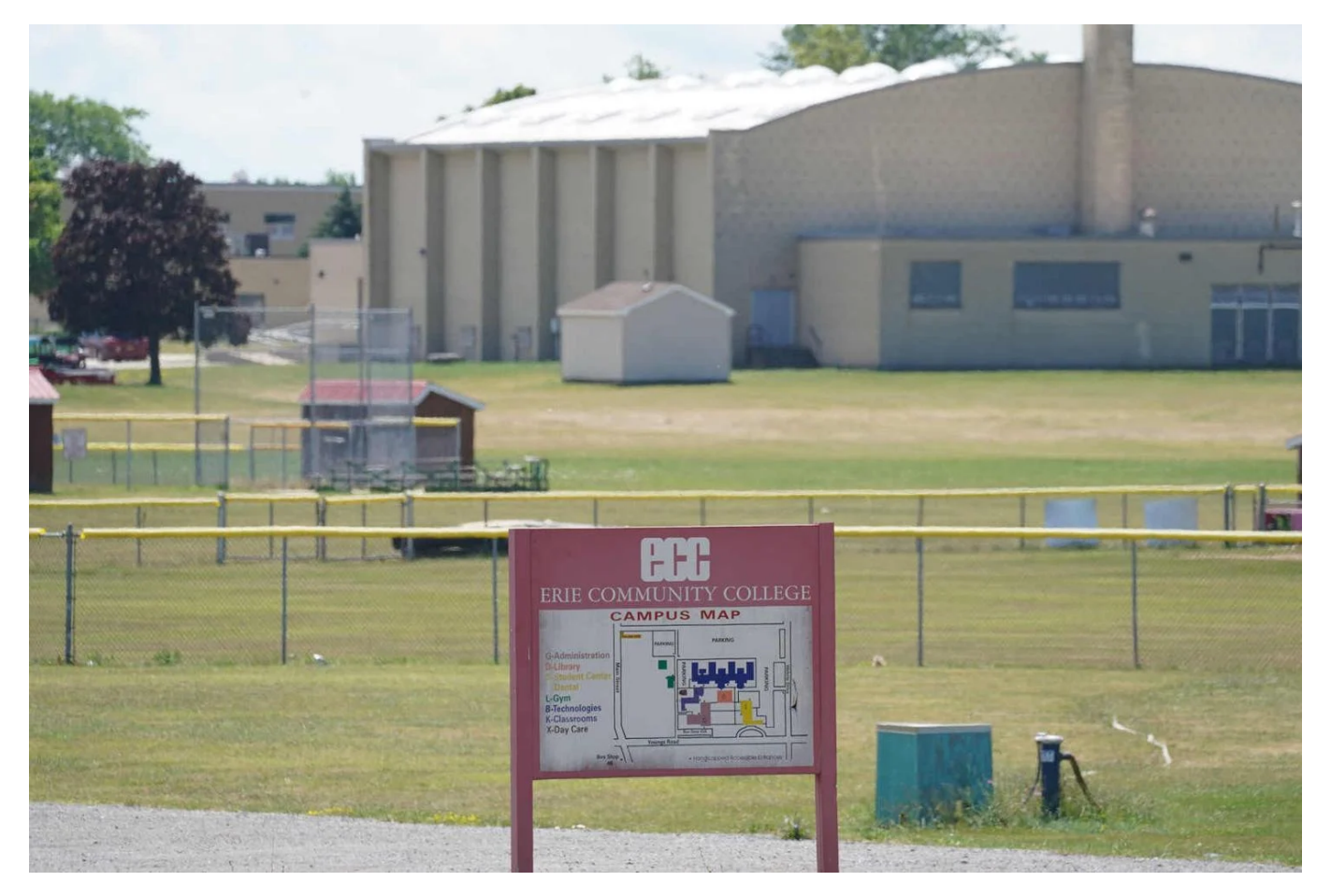
A map at an entrance on Main Street for SUNY Erie Community College North Campus.

The transfer also shifts more of ECC's facilities to its North Campus, strengthening its position as the central site with the college at a time when there are fears that the South Campus eventually could close as part of a consolidation move.