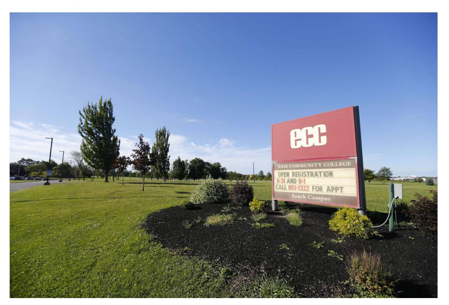
Erie Community College is transferring 56.9 acres of its South Campus in Orchard Park to the state for staging for the new Buffalo Bills stadium construction.