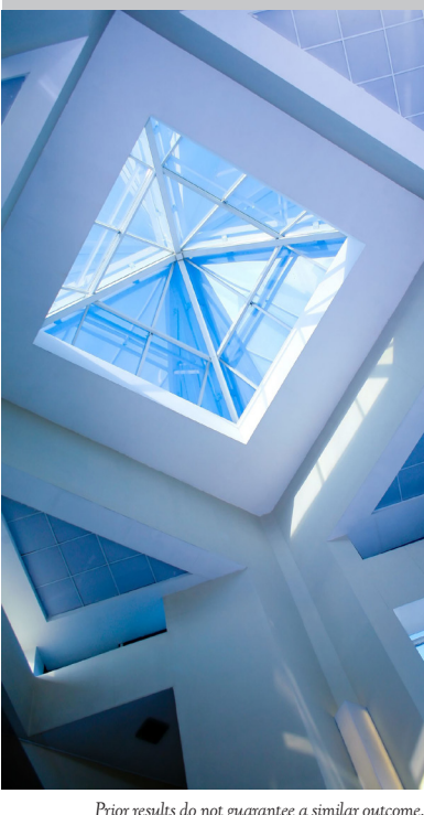
Prior results do not guarantee a similar outcome

Hodgson Russ advises colleges and universities and all types of related entities on the full range of their legal matters.