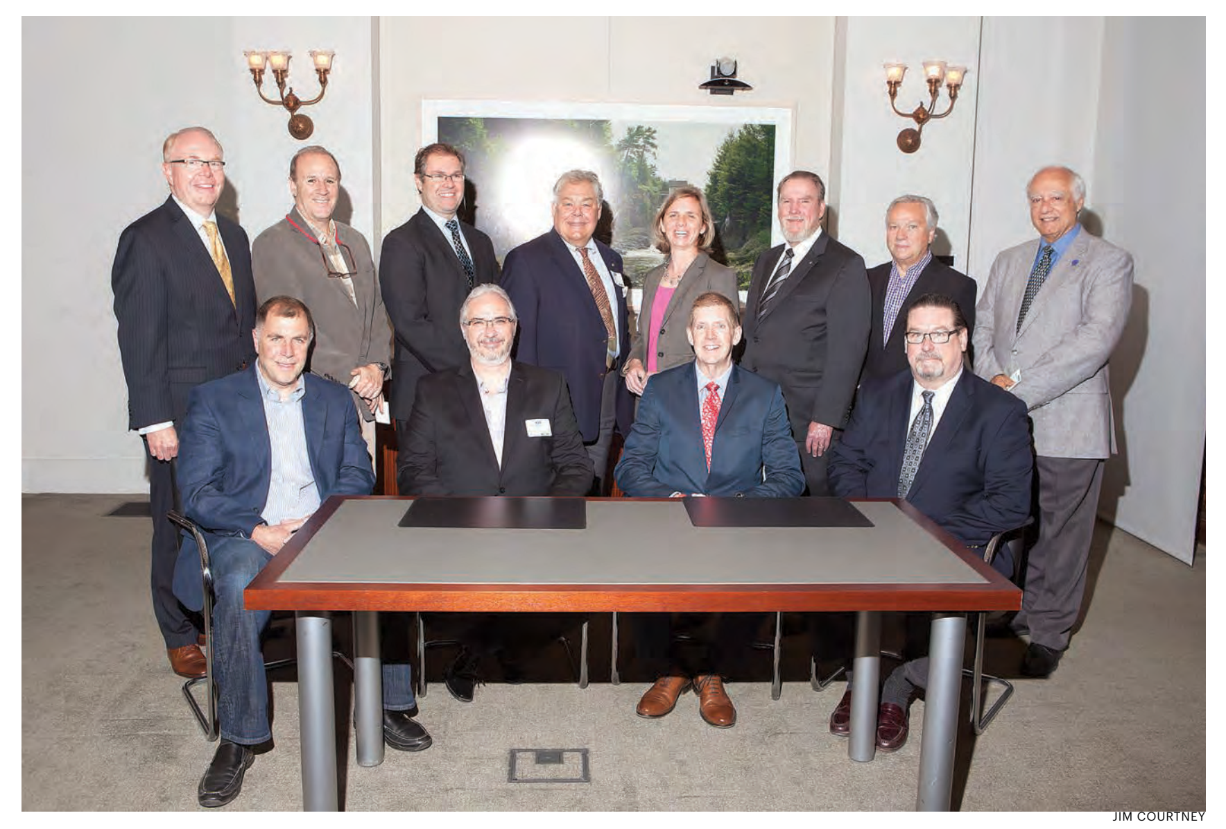
Professionals representing a variety of architectural and tourism interests discussed their challenges during a roundtable at the law offices of Hodgson Russ LLP in Buffalo.

ARCHITECTURE AND TOURISM LEADERS SEE MOMENTUM BUT WANT MORE